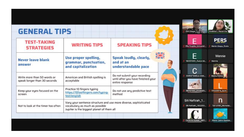
Figure 3. Tutorial on the Use of Duolingo Application

Today's students must acquire foreign language skills for various reasons substantiated by research and academic literature. Research conducted by Risadi et al. (2022) underscores that motivation to learn a foreign language, stemming from both intrinsic and extrinsic sources, plays a pivotal role in one's success in foreign language acquisition. Proficiency in foreign languages can enhance students' competitiveness and open up career opportunities, particularly in sectors such as tourism, international business, diplomacy, and academia.