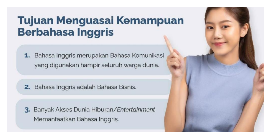
Figure 1. Materials Foreign Language Skill Working Opportunities

Research by Amin (2021) discusses how gamification in Duolingo can increase students' English learning motivation. By utilising the interactive and engaging features in Duolingo, students can feel more motivated and engaged in the language learning process. Thus, teaching students the Duolingo app can help improve their vocabulary acquisition, speaking skills, learning motivation, and engagement in the language learning process. By utilising Duolingo's features that support interactive and fun learning, universities can enrich students' language learning experience and improve their language skills effectively.